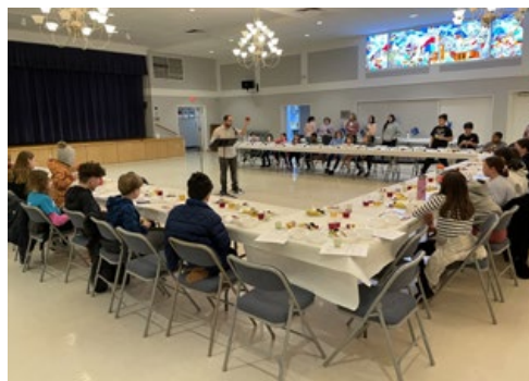
Grades K-7 Tu Bishvat seder

Our youngest students in grades K-2 learned about evening and morning rituals in Judaism, specifically the tradition of reciting the Shema before bed and the daily recitation of the morning blessings. Students brainstormed what they might be thankful for each morning, agreeing that we could definitely thank G-d for “mac and cheese.” Our 3 rd , 4 th , and 5 th graders have been doing some critical thinking, examining different hypothetical situations, reflecting on morality and Judaism, and asking themselves what it means to do the right thing.